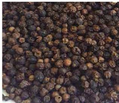
Black Pepper 500g/l Cleaned