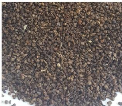
Pinhead Black Pepper 2mm