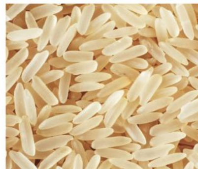
Long Grain Parboiled Rice 5% Broken