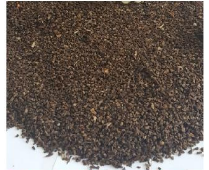
Pinhead Black Pepper 1mm