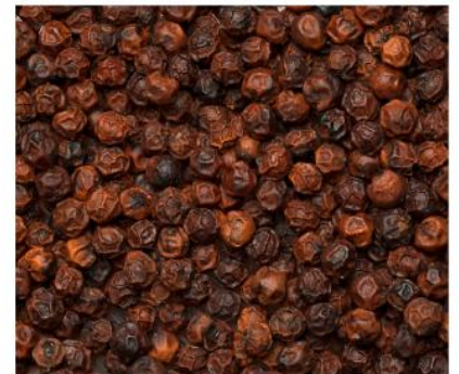
Dried Red Pepper