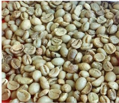
Arabica Screen 13 Wet Polished