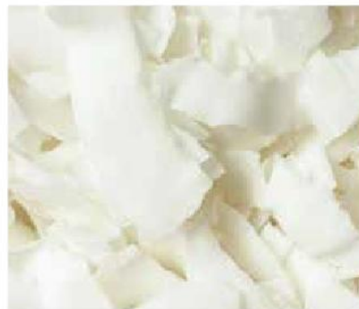
High Fat - Chip Grade