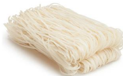
Freeze-Dried Red Pepper