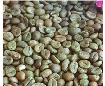
Robusta Screen 16 Unwashed