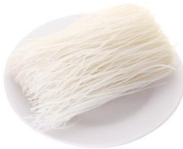
Freeze-Dried Green Pepper