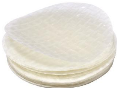
Rice Paper 16-18-22-28-31 cm Round/ Square shape