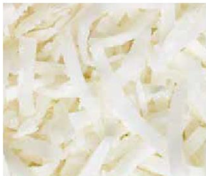
High Fat - Flake Grade