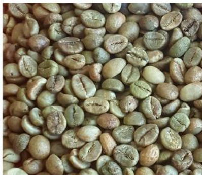
Robusta Screen 18 Unwashed