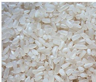
Rice 100% Broken