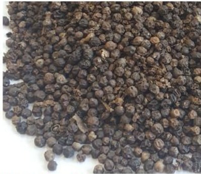
Light Berries Black Pepper 300g/l