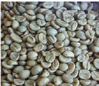
Arabica Screen 16 Wet Polished