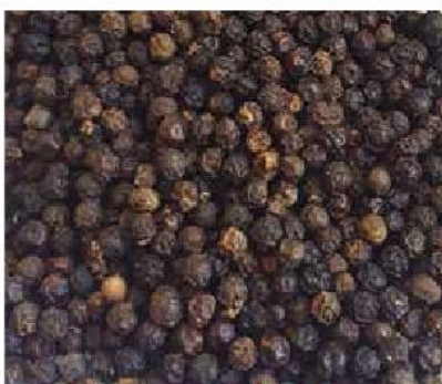
Black Pepper 550g/l Cleaned