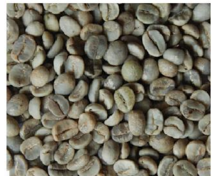
Arabica Screen 18 Wet Polished