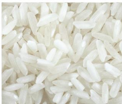
Long Grain White Rice 5%/ 15%/ 25%/ 50% Broken