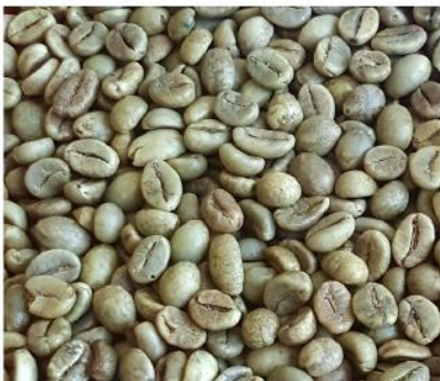
Robusta Screen 16 Wet Polished