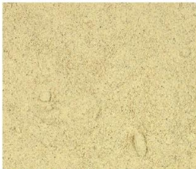
White Pepper Powder