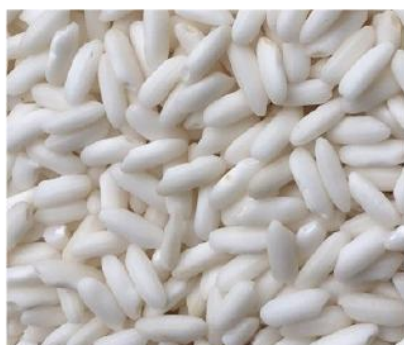
Long An Glutinous Rice