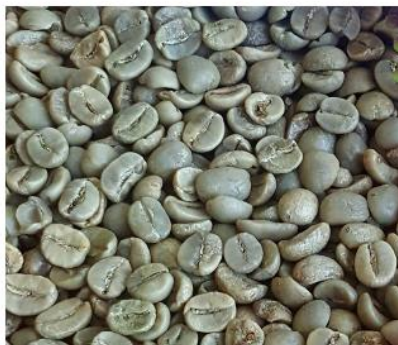
Arabica Screen 18 Unwashed