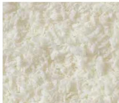
High Fat - Medium Grade