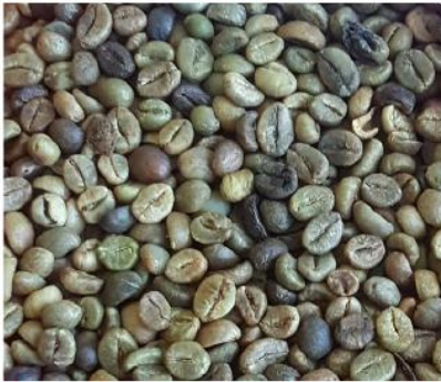
Robusta Screen 13 Unwashed