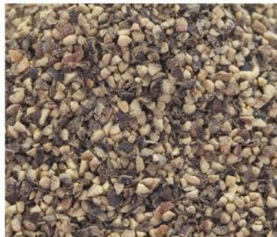
Cracked Black Pepper Mesh 16-28