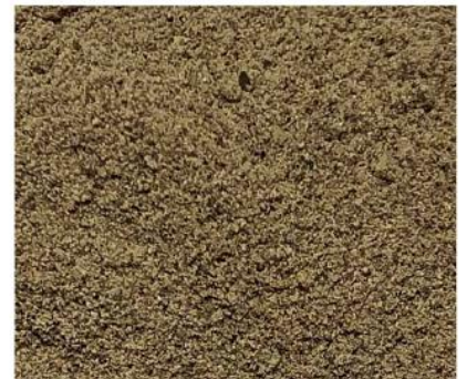
Ground Black Pepper Mesh 60-80