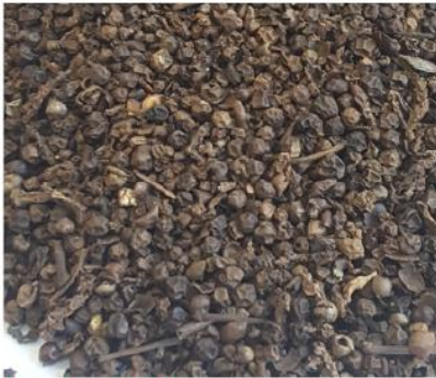
Light Berries Black Pepper 200g/l