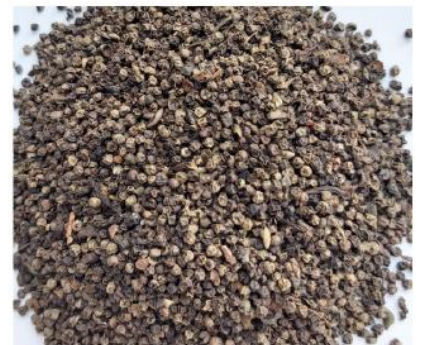
Pinhead Black Pepper 3mm