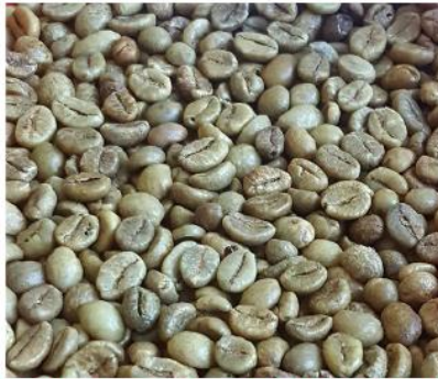
Robusta Screen 13 Wet Polished