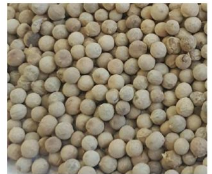
White Pepper 630g/l