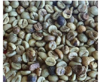
Arabica Screen 16 Unwashed