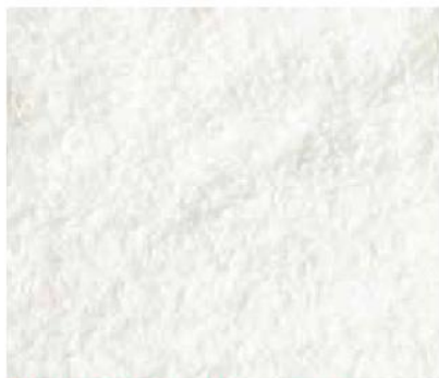
High/ Medium/ Low Fat Fine Grade