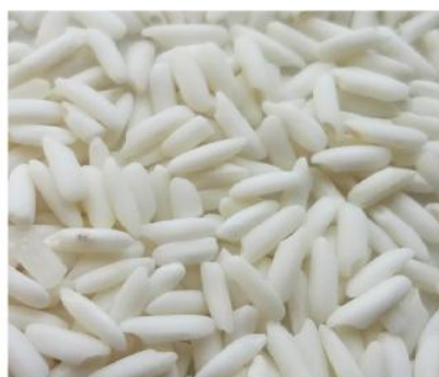
An Giang Glutinous Rice