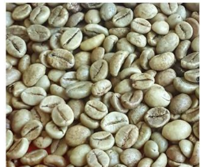
Robusta Screen 18 Wet Polished