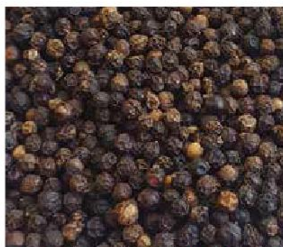
Black Pepper 570g/l Cleaned