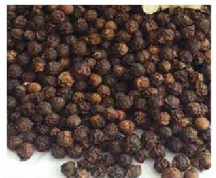
Black Pepper 600g/l Cleaned