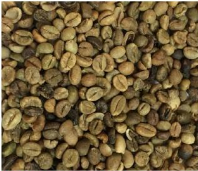
Arabica Screen 13 Unwashed