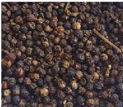
Black Pepper 500g/l FAQ