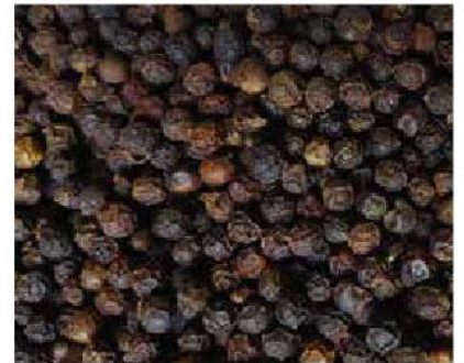
Black Pepper 5mm