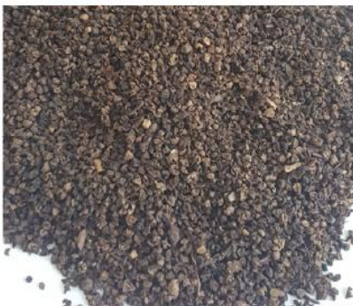
Pinhead Black Pepper 1.5mm