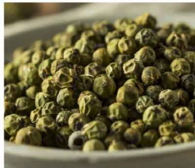
Dried Green Pepper