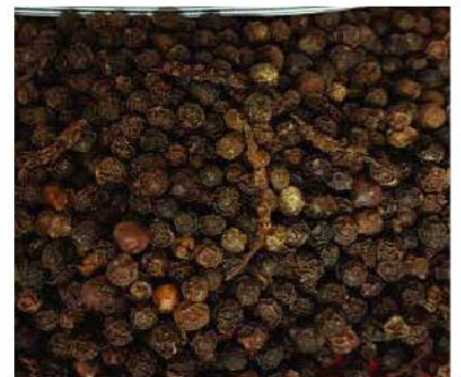
Black Pepper 550g/l FAQ